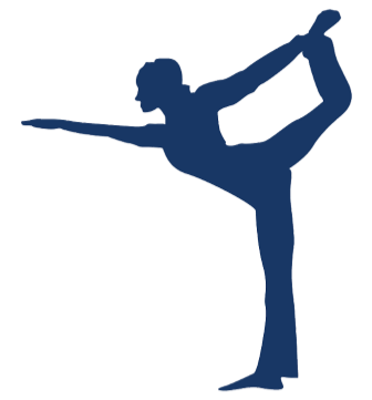
THE ANKLE HOLD