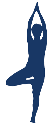
THE PEG LEG