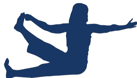
SITTING TOE TOUCH