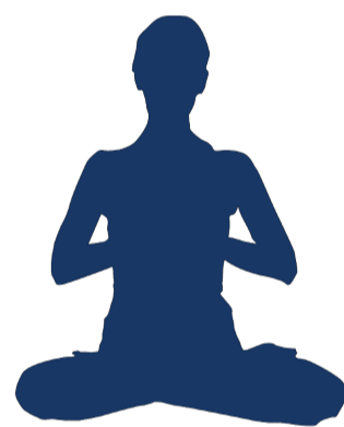
CRISS CROSS APPLE SAUCE