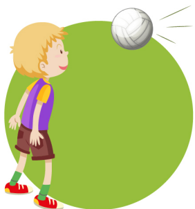
Eyes on the ball