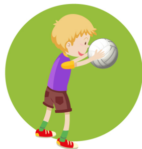
Balls above the waist = butterfly fingers