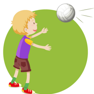
Hands move to the ball