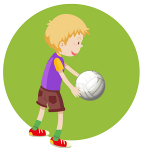
Balls below the waist = wiggly worm fingers